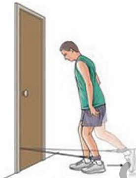
Knee stabilization: A