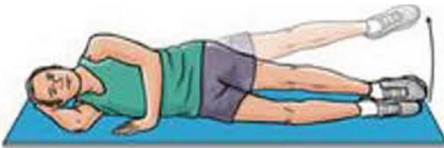
Side-lying leg lift