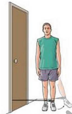
Knee stabilization: B