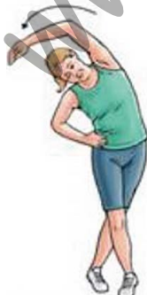
Iliotibial band stretch (side-bending)