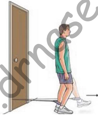
Knee stabilization: C