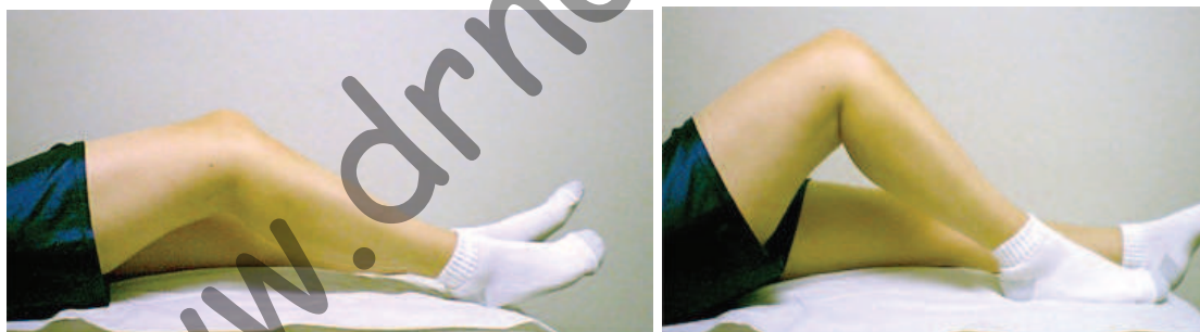
Figure 4. Heel slide – leg is pulled toward the buttocks