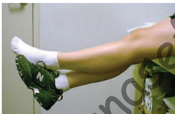
Figure 7. Use the non-injured leg to straighten the knee