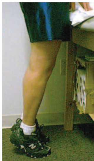
Figure 11. Toe Raise