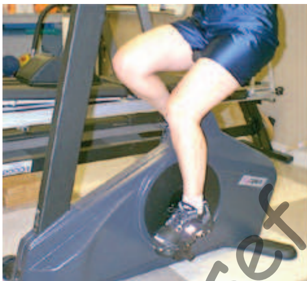
Figure 6. Stationary Bicycle helps to increase strength