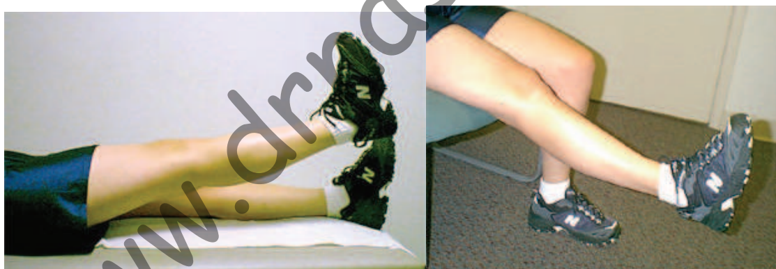
Figure 9. Straight leg raises – lying (left) and seated (right)

This exercise can be performed out of the brace when the leg can be held straight without sagging (quad lag). Once you have gained strength, straight leg exercises can be performed while seated. See Figure 9