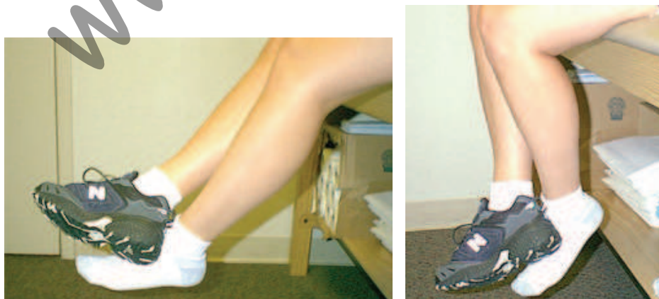
Figure 8. Passive Flexion allowing gravity to bend the knee to 90 degrees