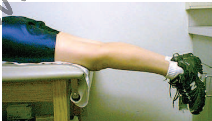
Figure 2. Prone Hang. Note the knee is off the edge of the table.