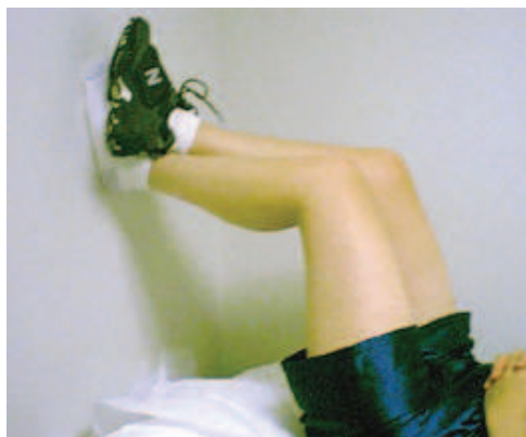
Figure 3. Wall Slide: Allow the knee to gently slide down