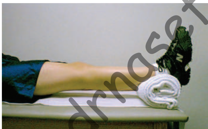
Figure 1. Heel prop using a rolled towel.