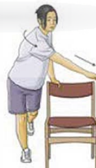
Balance and reach exercise B