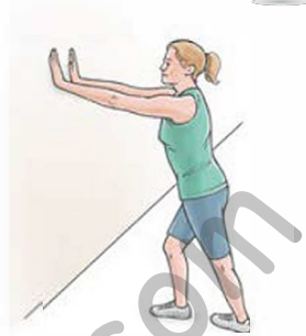
Standing calf stretch