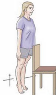
Eccentric calf strengthening