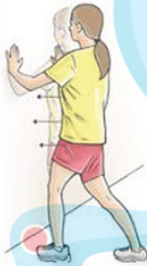
Standing soleus stretch