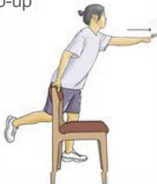
Balance and reach exercise A